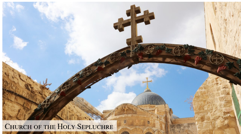
CHURCH OF THE HOLY SEPLUCHRE

VISITS TO: AMMAN · PETRA · KERAK · MADABA · MT. NEBO · JERASH · TEL AVIV · CAESAREA · NAZARETH · CANA · TIBERIAS · SEA OF GALILEE · JORDAN RIVER · MT. TABOR · JERUSALEM · GETHSEMANE · EIN KAREM · BETHLEHEM · QUMRAN · JERICO · DEAD SEA · MT. OF OLIVES · MT. ZION · HOLY SEPULCHRE